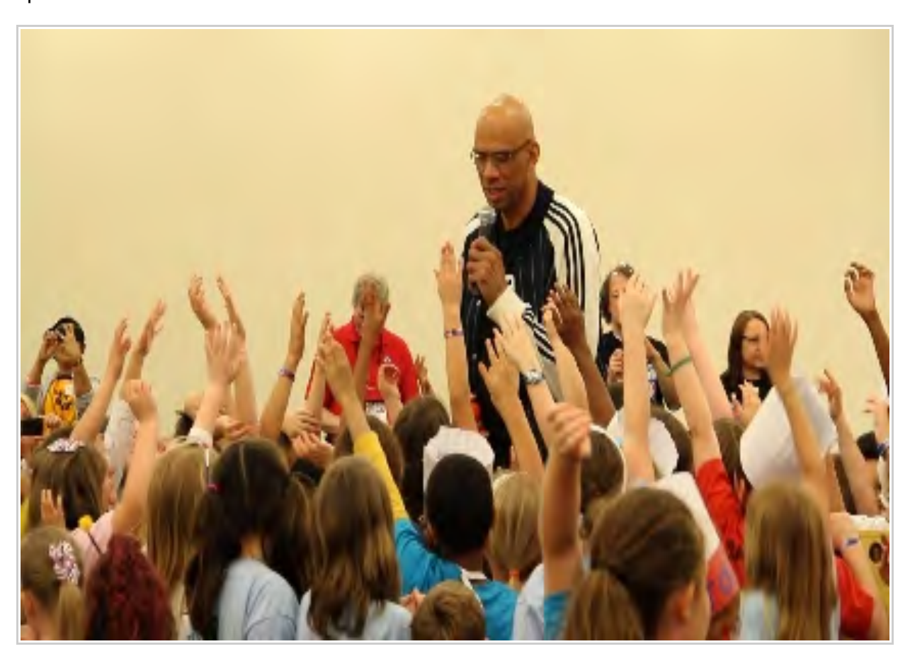
THE <u>perfect helper</u> for a robotic basketball competition

teachers, philanthropists, parents and members of the press like me but also titans of sport and music.