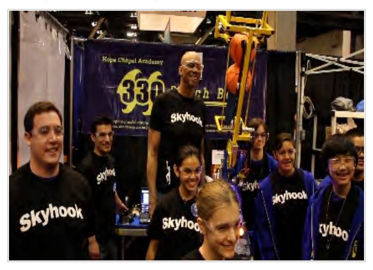
Kareem Abdul-Jabbar, the NBA's all-time leading scorer hangs out cheering on FIRST team 330 and his namesake robot "Skyhook"

it was very interesting meeting the students from all over the United States and watch them compete in an arena where they can all be winners."