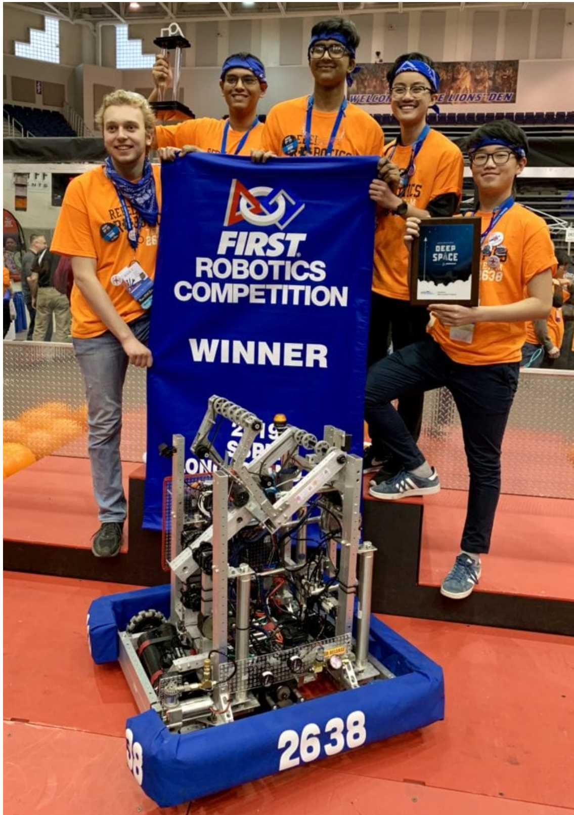
South High's Rebel Robotics team claimed first place at the Regional FIRST Competition late last March.

The Great Neck South High School Rebel Robotics Team won first place in competition plus two additional awards at the School-Business Partnerships of Long Island (SBPLI) Regional FIRST Competition at Hofstra University from March 24–27.